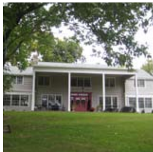
The Murray House 3774 Urbana Road

This large home will be open for the tour ONLY ON THE EVENING of December 5 from 5:00 to 9:00 p.m.