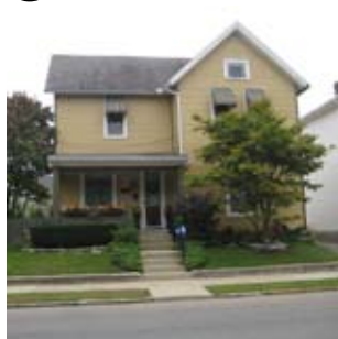
The Rogers House 1631 Lagonda Avenue