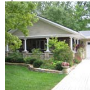
The Brugger House 515 Dorchester

This home was built in 1959 and is a mid-century ranch, however the inside is French country that is her favorite style. The crown molding and French fireplace wall in the living room is custom made of maple as well as the vaulted ceilings and cupboards in the kitchen/dining rooms. The baseboard pattern comes from a pattern of the late nineteen hundreds. The Victorian bar is replicated from a picture in the 1890's. The oil painting over the living room fireplace is of the Springfield Fountain Square and Arcade in 1899 by local artist Eunice Bronkar. The pressed flower pictures in the home were made from flowers from Patty's garden. She states that Christmas is her favorite time of the year and her favorite tree is the white angel tree filled with over 260 angels. She is happy to share her home with you this holiday season and was assisted by Bonnie's Nursery and Garden Center with special touches.