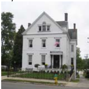
Woman's Town Club 805 East High